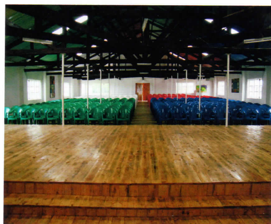
Above— The Community Hall stage awaiting the next show or event.

This entire project was made possible by donations from Mufindi Orphans, Inc. We here give special thanks to all those who have made donations and become a part of this special project!